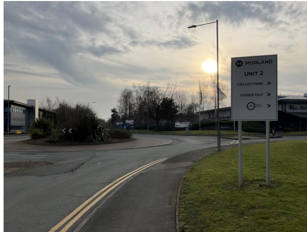
3 - Business units on the Buttington Cross Enterprise Park just outside Welshpool.