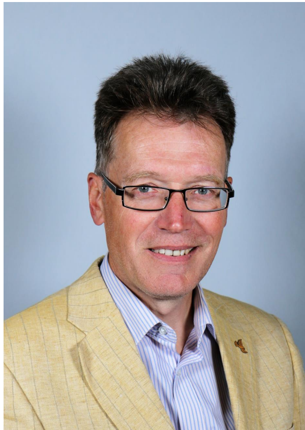
2 - Councillor Jake Berriman, Leader of Powys County Council