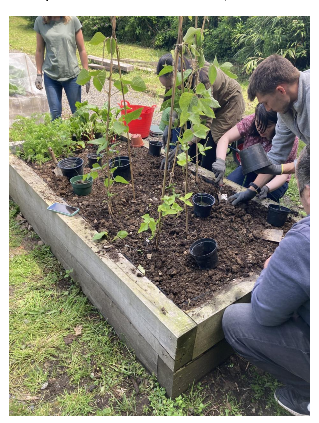
9 - Gorwelion Day Hospital garden

The Multiply Key Skills Tim Gydol Oes was awarded £866,863 of UK SPF funding.