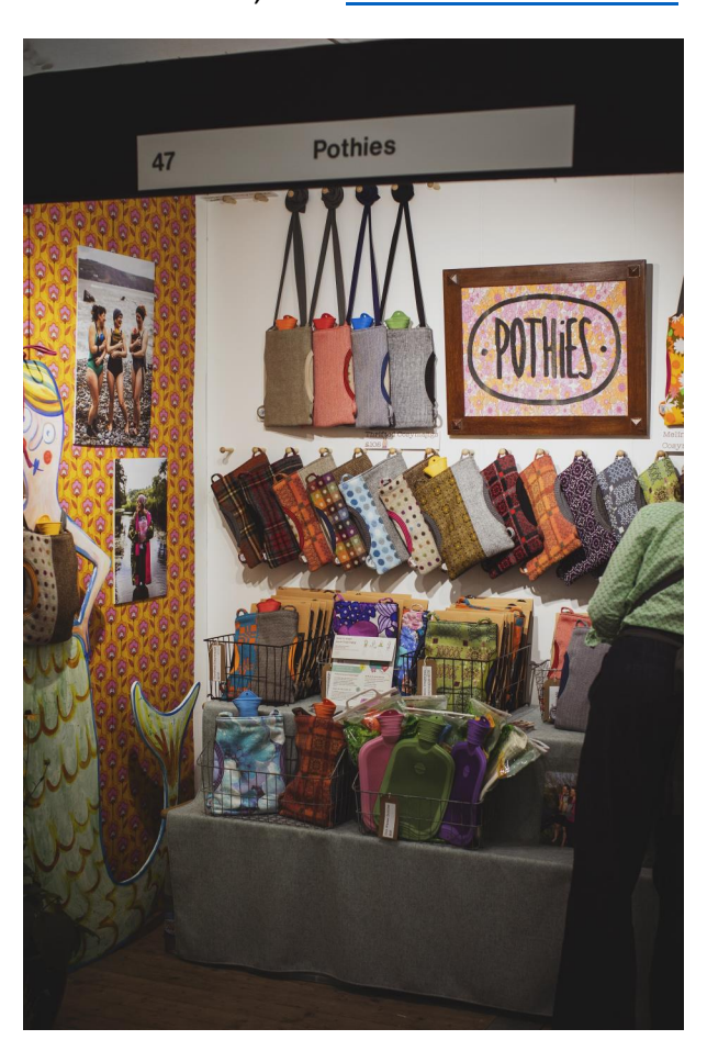
1 - Stalls at the Cardigan craft festival by local producers

For information about the Craft Festival, visit: <a href="www.craftfestival.co.uk">www.craftfestival.co.uk</a>