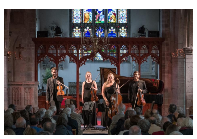
6 - Presteigne Festival concert