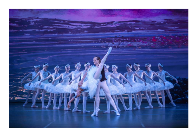
5 - Brecon Festival Ballet's production of Swan Lake Act 2 earlier this year

Visit <u>Powys Events - Powys County Council</u> for event project information, networking, and training or to sign up your event.