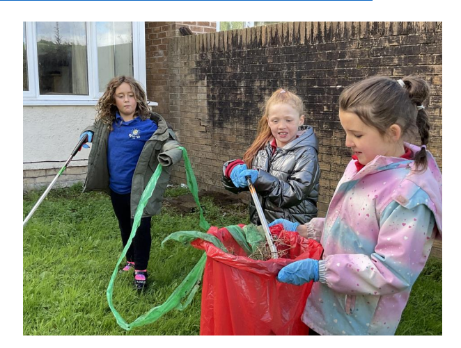
3 - A community clean-up on the Treowen housing estate in Newtown which included children from Treowen Primary

For more information on the Caru Powys Volunteer Litter Picking kits, visit: <a href="https://en.powys.gov.uk/article/8026/Volunteer-Litter-Picking">https://en.powys.gov.uk/article/8026/Volunteer-Litter-Picking</a>