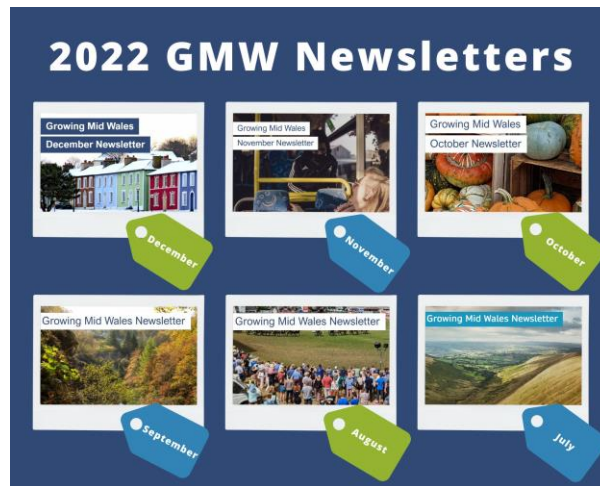
5 - 2022 Growing Mid Wales Newsletters