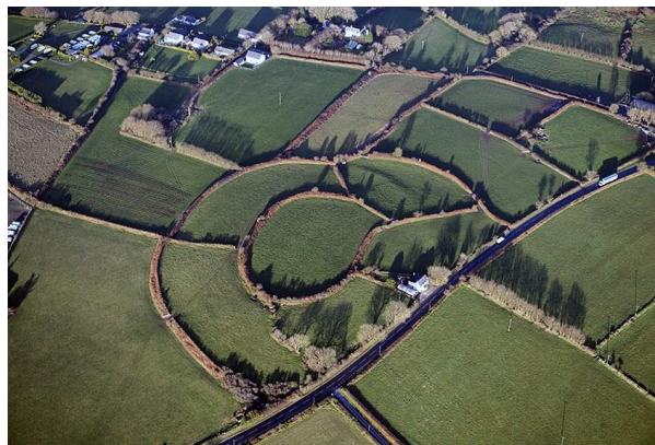
1 - Castell Nadolig, Ceredigion

In coastal Ceredigion overlooking Cardigan Bay is an Iron Age hillfort with a curious name; it appears to be the only hillfort in Wales which bears the name 'Christmas'.