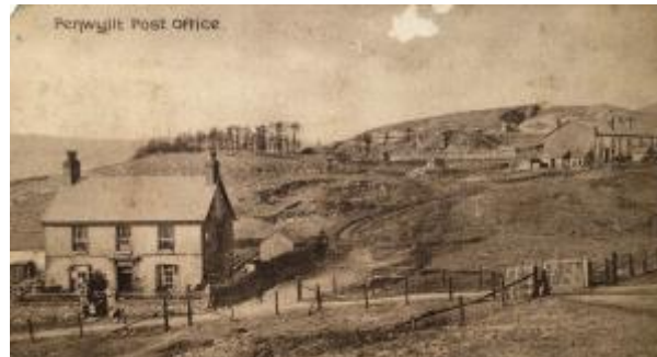
1 - Courtesy of Powys Archives collection. Catalogue no. B/X/136/P/9

For more historical images and interesting facts on Powys, follow Powys Archives on Facebook, Twitter or Instagram.