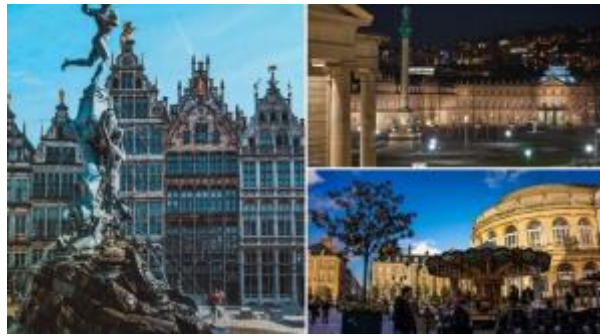
4 - Stuttgart, Rennes, Antwerp

For further information or to discuss a proposal, please contact the Welsh Government Horizon Europe Unit via HorizonEurope@gov.wales .